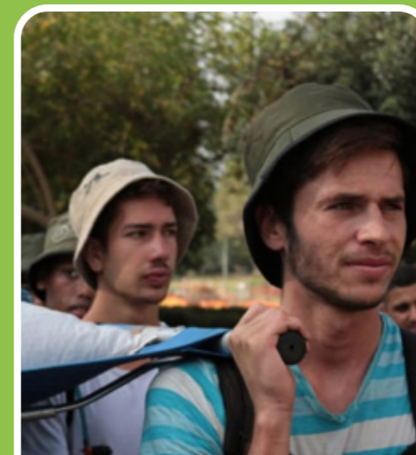
IDF Basic Training