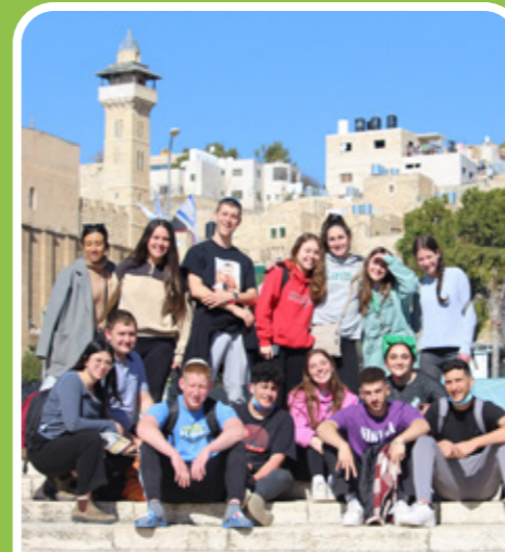
Gush Etzion Seminar