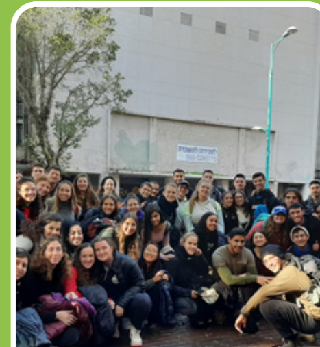
Israeli Society Week