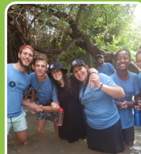
2 Weeks Israel Trek